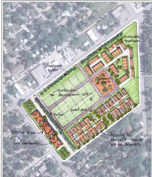
17 Minnesota Design Team SHARED VISION Morris, MN October 2005

6th Street Corridor - This group is working on creating a bike lane and including lights, banners, and planters along the street. Major projects focusing on the curbs and gutters might be started in 2007.